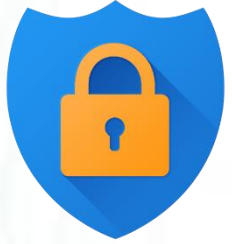
Extra Safety & Security