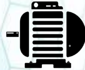
Brushless Direct Current